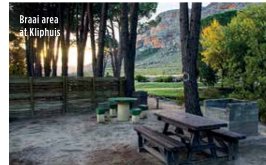
Braai area at Kliphuis

From R120 pn 021 483 0190 reservation.alert@capenature.co.za capenature.co.za