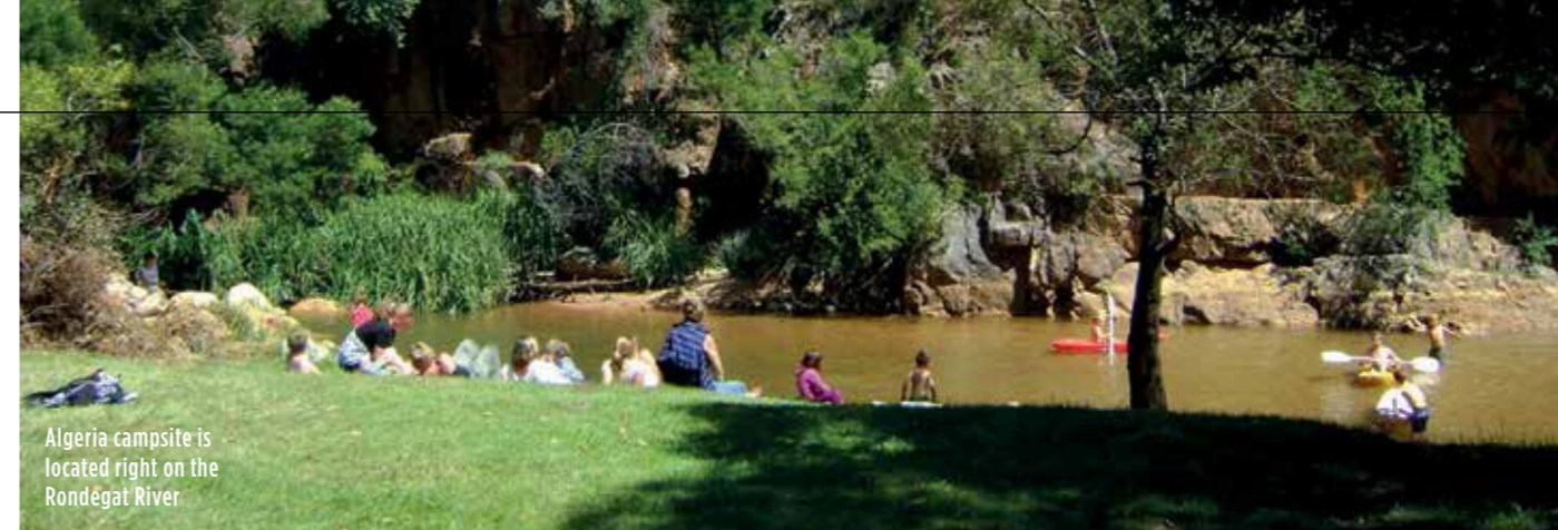
Algeria campsite is located right on the Rondegat River