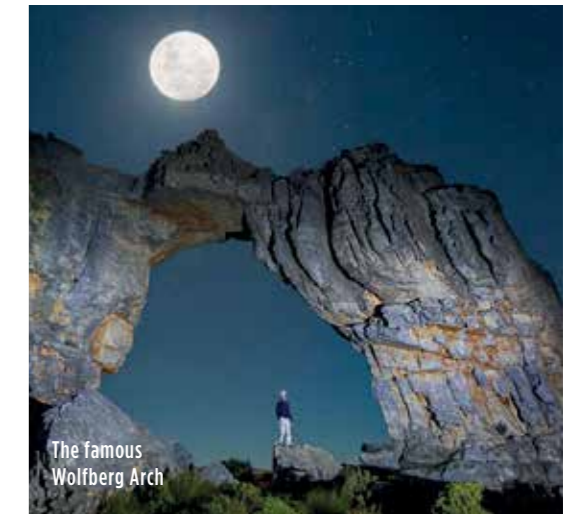
The famous Wolfberg Arch

Permits from R120 pp climbing.co.za/wiki/Krakadouw