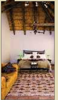
IAi-IAis Hot Springs Spa offers great facilities for R&R