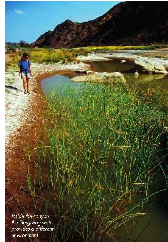
Inside the canyon, the life-giving water provides a different environment

Geologists will tell you that the mind-blowing Fish River Canyon was formed by a combination of water erosion, glaciation and continental drift – but this explanation is far too clinical for me. A local legend passed down from generation to generation tells of a giant snake that plagued the Nama people, eating livestock and terrorising humans. The tribe banded together to take the snake down and the beast was speared. But as it writhed in agony, its tail cut deep swathes into the desert, thus forming the serpentine canyon we know today.